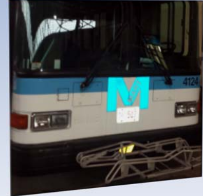
MART now has bike racks on all our fixed route buses and shuttle vans